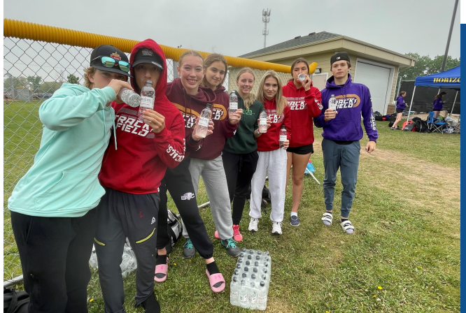
We made sure our high school track and field athletes from H. Hardcastle School stayed hydrated at provincals in Saskatoon Friday, June 2. Congrats to all the students who attended and competed.